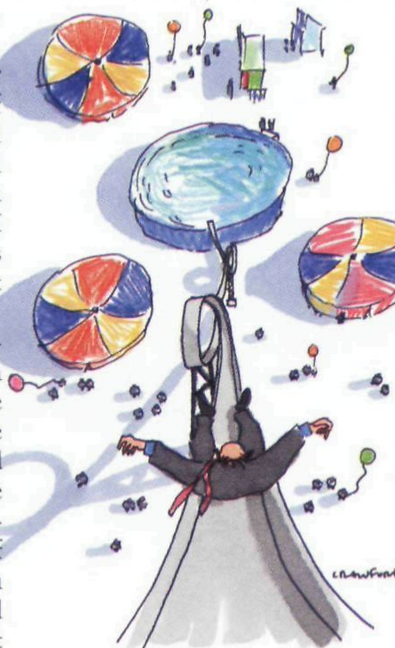
When professionals don't do their jobs perfectly, they zoom into a "doom loop."

Senior managers had identified six consultants whose performance they considered below standard. In