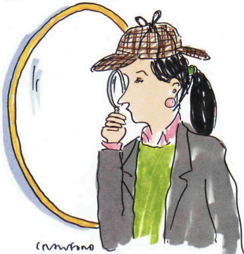
The professional who reasons productively casts a critical eye on her own role in a company's problem.

Manager: "Well, I certainly don't think you sound like you're whining. But two thoughts come to mind. If I understand you correctly, you were complaining, but the